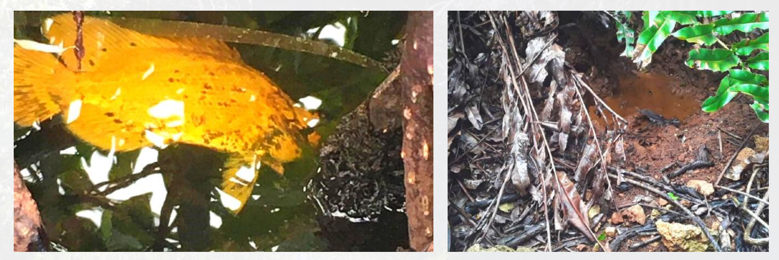
One of the many faunal species found in Portland Cottage

For, the period June- October of this financial year, the Agency assessed mangrove and swamp forests in Portland Cottage and Manatee Bay in Clarendon. These areas represent one of the largest remaining Mangrove ecosystems on the island, with vibrant biodiversity. These ecosystems cater for many endangered species; serve as fish sanctuaries and shelters for crabs and shrimps.