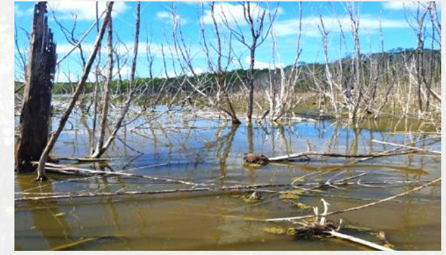
Significant die back in Manatee Bay due to stagnant water and low tidal exchange

However, the mangrove forests observed in Portland Cottage and Manatee Bay sub-blocks have developed a high level of resilience. While the records show that mangrove forest regeneration is being negatively affected, we have discovered that this is mainly related to the adverse effects of human disturbances as mangroves recover quite rapidly from hurricanes,