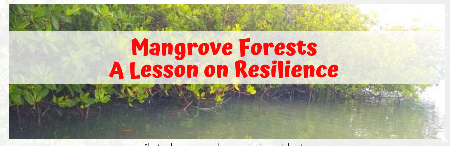
Short red mangrove saplings growing in coastal waters

Inland mangroves are proving more likely to recover and survive changes in their environment once anthropogenic threats are low.